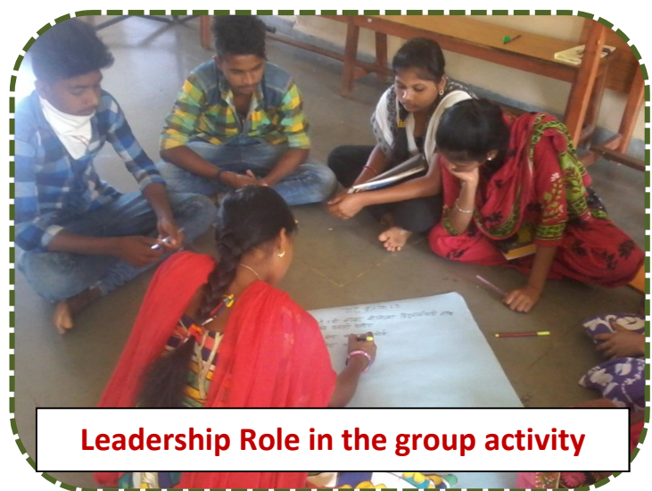
Leadership Role in the group activity

I can truly say that what I am today, I owe it all to ADA. The thoughtfulness and concern of many persons have contributed to my growth and has enriched my life. Surely God will bless you for your gesture of kindness towards me.