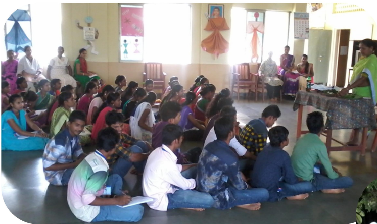
Talk on Herbal Medicine