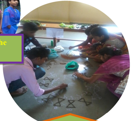
Rangoli Competition using Natural Items