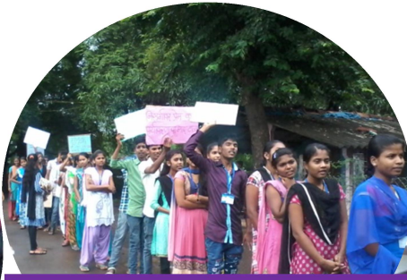
Rally on cleanliness & the Environment