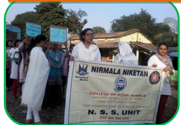
A 8 day NSS Camp organised by the College of Home Science Nirmala Niketan