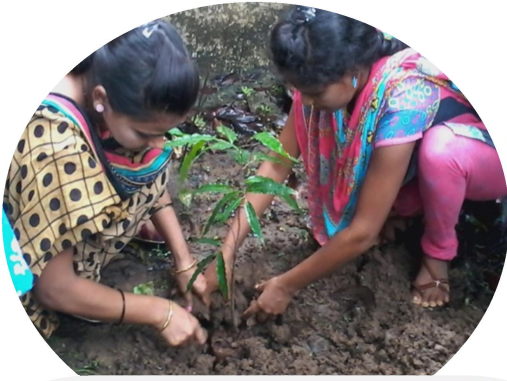
Plantation of Saplings