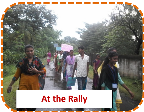
At the Rally

All the material (for stitching & sewing) was provided to me by the College through ADA. I appeared for the Exams, conducted by the Maharashtra State Board of Vocational Education in Tailoring. I secured a first class. Earlier I disliked stitching but now I am confident in stitching Childrens, Ladies and Gents Garments. Now I am more confident in Computers and English, since I was already into these subjects while I was in College.