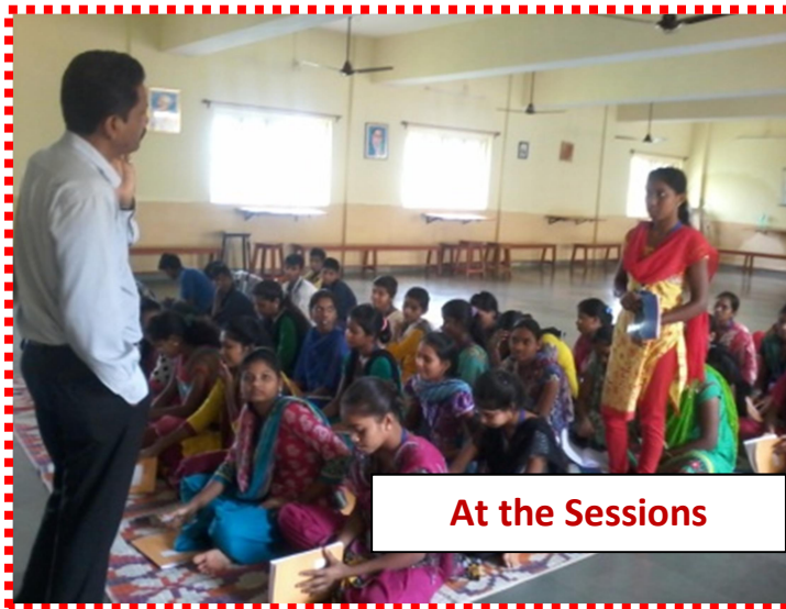
At the Sessions

various skills such as “Tailoring”, for which I got a First class from the “Maharashtra State Board of Vocational Education”. I am now confident to stitch Children’s clothing, Gents and Ladies Garments. I also learnt various embroidery stitches.